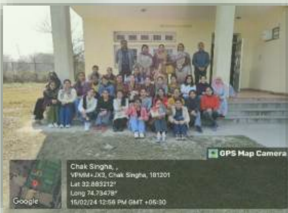
Chak Singha, -- VPMW-JX3, Chak Singha, 181201 Lat 32.883212° Long 74.73478° 15/02/24 12:56 PM GMT +05:30