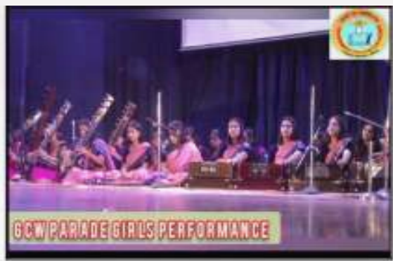
GCW PARADE GIRLS PERFORMANCE