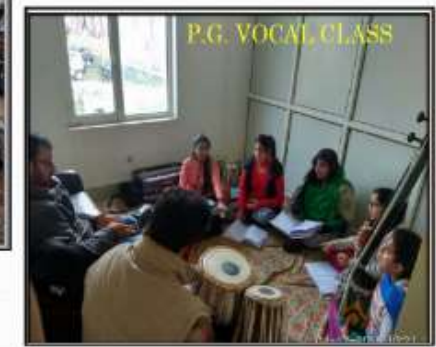
P.G. VOCAL CLASS