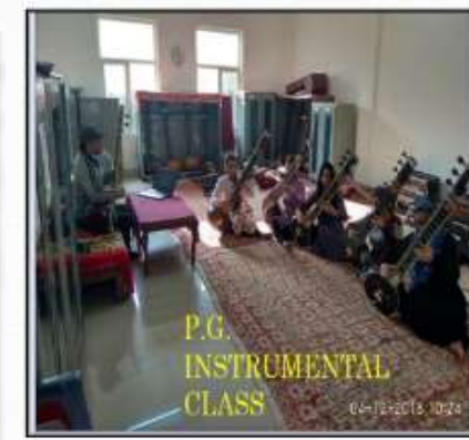
P.G. INSTRUMENTAL CLASS