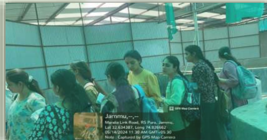
Jammu, -- Mankla Link Road, RS Pura, Jammu, Lat 32.534387, Long 74.826662 05/14/2024 11:30 AM GMT+05:30