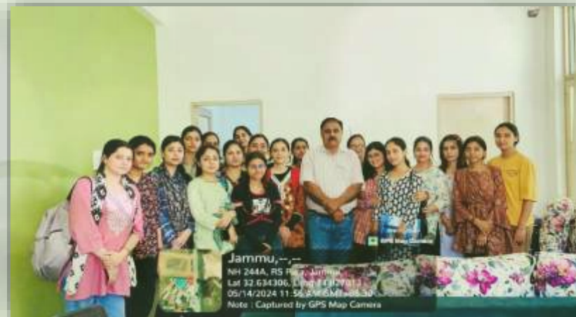
Jammu, -- NH 244A, RS Pura, Jammu, Lat 32.634306, Long 74.791711 05/14/2024 11:56:21 AM GMT+05:30 Note: Captured by GPS Map Camera