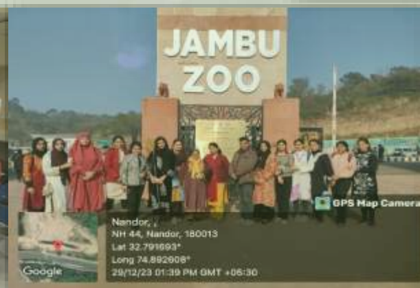
Jammu, -- NH 44, Mador, 180013 Lat 32.791693° Long 74.892608° 29/12/23 01:39 PM GMT +05:30