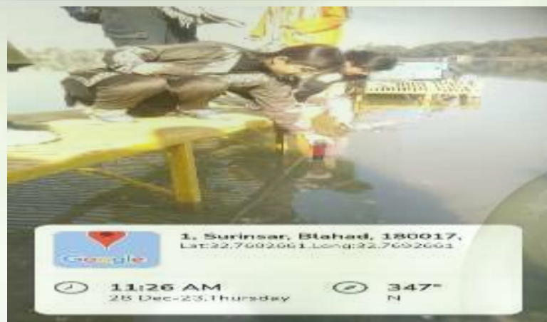
1, Surinsar, Bhalad, 180017, Lat:22.7692661, Long:74.692661